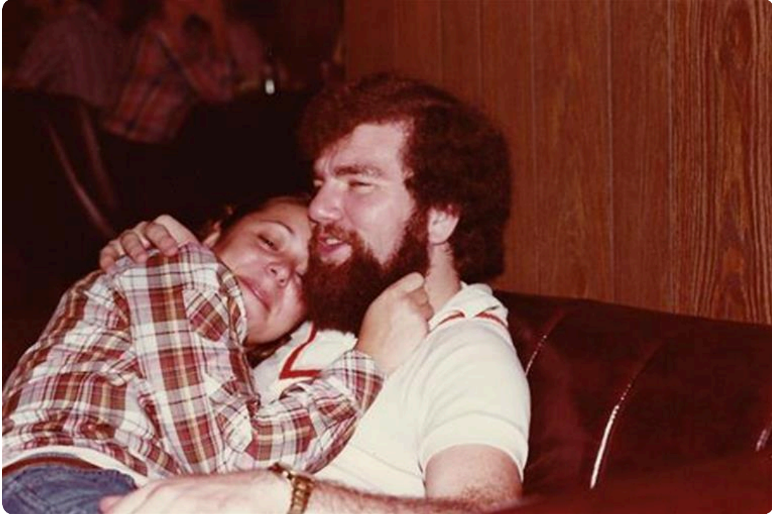
We were sweeties after a blind date, and then for 40 more years, on and off.